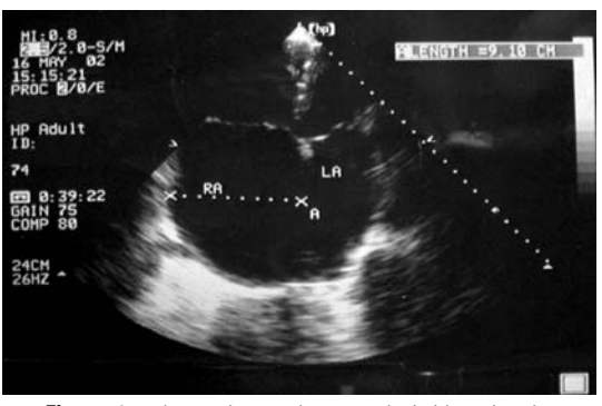
Figure 1. Echocardiography revealed dilated right heart chambers and secundum type ASD of 17 mm

Spontaneous closure of the ASD may occur with certain rates between 3-67% reported in the literature. Size of the defect and age of the patients are strongly related with the closure. Smaller defect size, as much as 4-5 mm, and younger age especially under 2 years are promoting factors for spontaneous healing. On the other hand, another